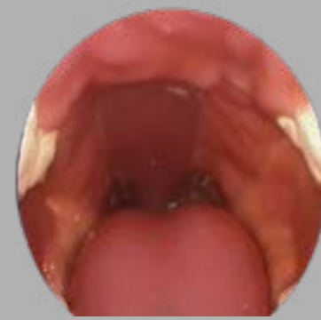
Mouth with Tongue and Uvula