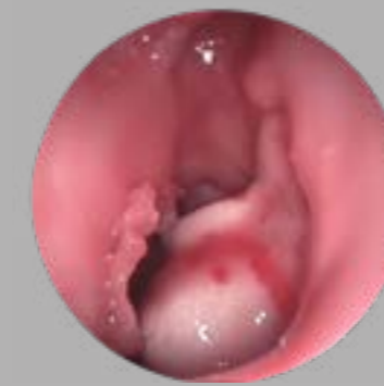
Laryngeal Tumor (Art-No.: PM-abm)