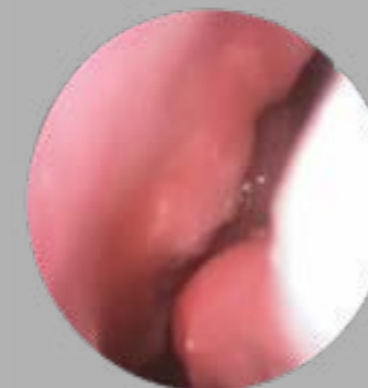
Bulla Ethmoidalis and Uncinate Process