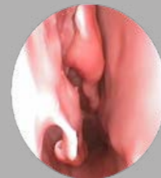
Inferior and middle turbinate